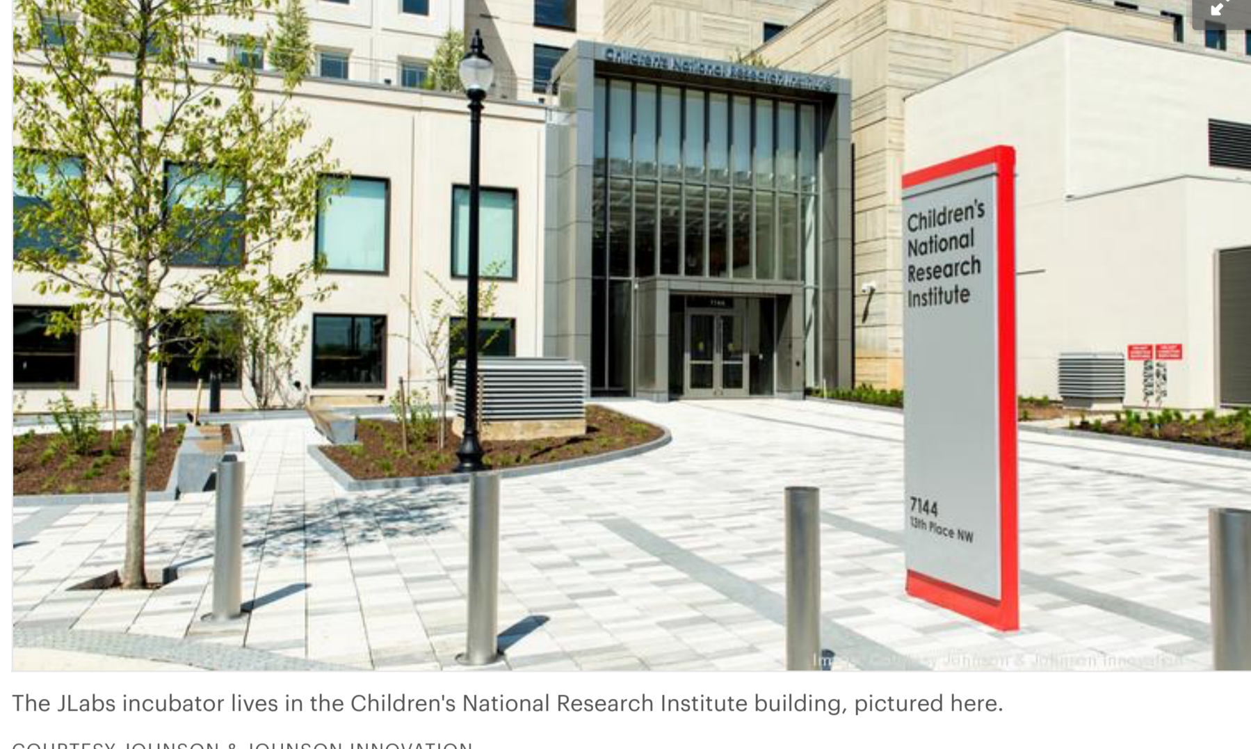
The JLABs incubator lives in the Children's National Research Institute building, pictured here.